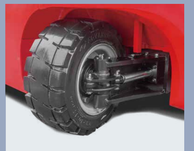
Smaller turning radius