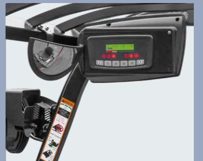
Easy to see display