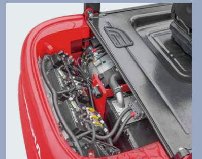
Easy for maintenance