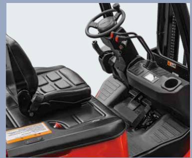
The truck is ergonomically designed to provide a good view and a large operating space