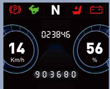
Multifunctional color screen instrument with graphical interface design is simple and intuitive for operator