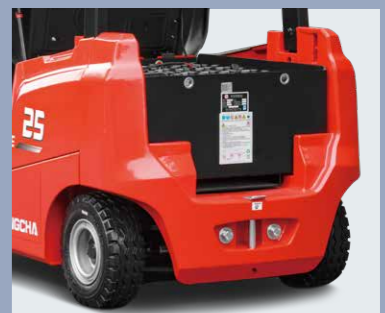
Battery is placed at the rear of the truck