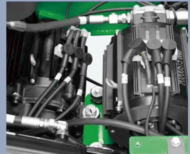
Both the traction and oil pump adopt permanent magnet synchronous motors for the Enpower controller