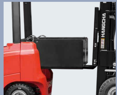
The battery can be removed from the rear enables the battery to be replaced more flexibly (Only for the lead-acid battery)