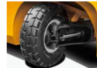
Steering bridge, tires