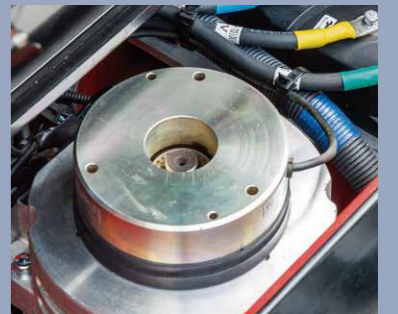
Electrical Park Brake (EPB) system