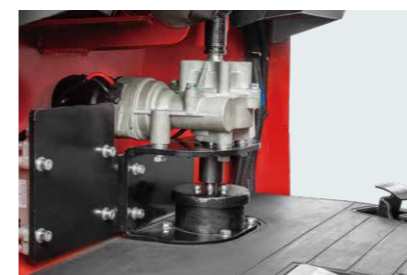
Electronic power steering system (for stand-up driving type tractor)