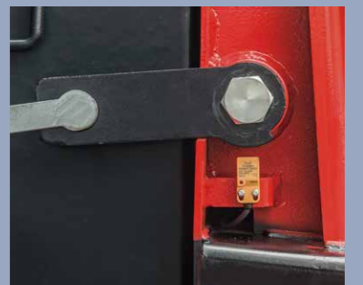
The locking device of the battery is provided with the safety protection function. Only if the locking device is rotated in place, the tractor can travel