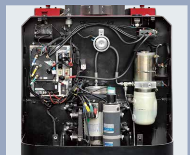
Fully opened hood, easy accessibility of all components, is easy for service