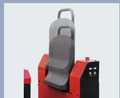
Backrest height can be adjusted within a certain range, and the backrest with hip support can greatly improve the comfort of the operator