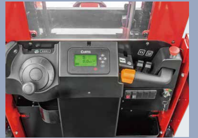
The FREE accelerator lever with sensor switch, as standard configuration, can prevent mis-operation during the work