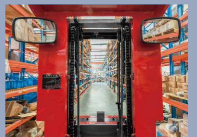
Better vision for operation