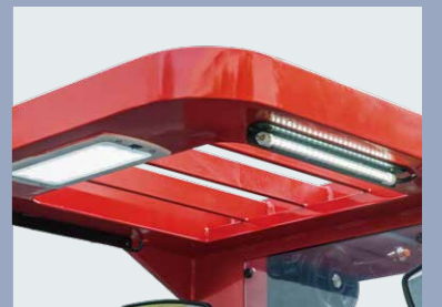
LED top lamp can provide bright operating environment