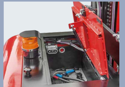
The rear hood can be removed easily to facilitate maintenance work on parts such as hydraulic unit, electronic control system and the motor