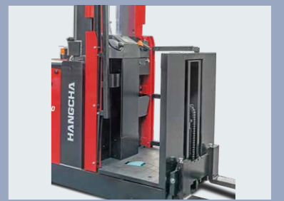
Order picker works only when the side barriers are all lowered