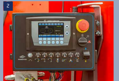
Base control box: the control box can be used to control each action of the device, easy to understand