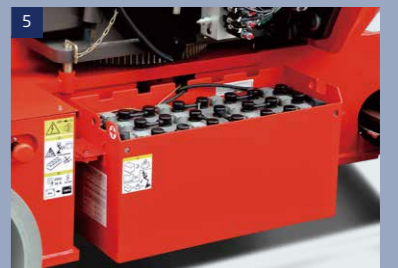
Standard tracking battery: Reduce 40% of the charge time, raise 50% of the life time