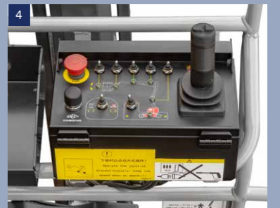
Basket control box: each action of the device can be controlled through the control box to quickly reach the working area, and the control is simple and easy to understand