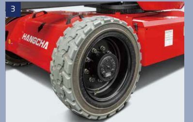
Tires: foam-filled tires with good off-road performance