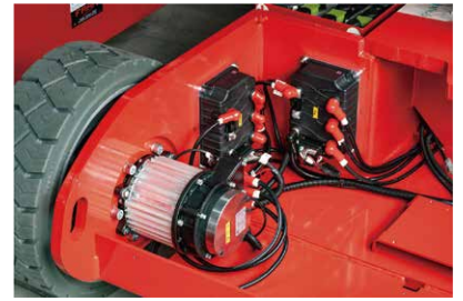
Permanent magnet drive (Standard)